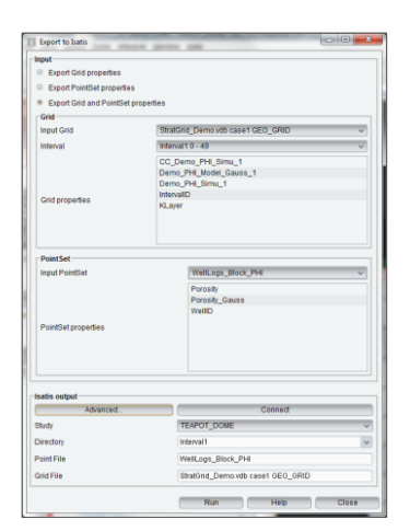
Export to Isatis interface

Isatis plug-in has been designed using the Halliburton/Landmark DecisionSpace® Software Development Kit and Geovariances GTXserver development kit.